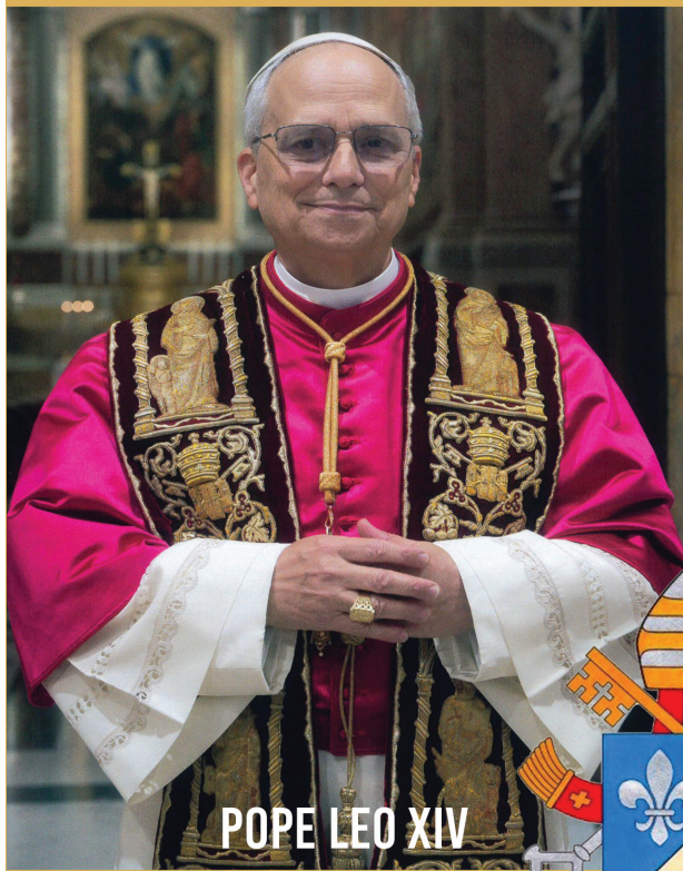
POPE LEO XIV

MAY 18 TH , 2025 — 5 TH SUNDAY OF EASTER